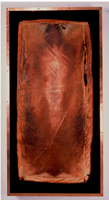
"Icarian Series"

The completion of a series of large translucent suspended structures made from expanded aluminum in the shape of towers, houses and cubes signaled the beginning of a theme in my work that I have called "the presence of absence". I called these pieces "Reliquaries". I often thought of them as spirit houses and they were titled with the initials of friends and loved ones who had died from AIDS. In those pre-AIDS drug years the streets of San Francisco were haunted by men on the verge of death. Skeletal and wasted, moving in a frightening borderland between existence and oblivion. Beside them the air was thick with the ghosts of their friends and lovers. This communal reality, this common experience of being half-dead and half-alive found its expression in these spectral constructions. They were hung so as to rotate slowly- now revealing, now concealing the contents of their interiors.