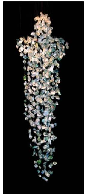
“Lazarus”

The second related sculpture, “Lazarus”, was made from cullet: the chunks of glass left over from the work of glassblowers. The creation of this piece coincided with the advent of antiretroviral drugs as well as the death of my second life-partner to AIDS. Up to that year all of those living with AIDS were expecting to die within a short amount of time. The protease inhibitors and the various drug cocktails gave many of us a new hope for life. We were like the Biblical figure Lazarus, being resurrected from the darkness of the tomb. The floating particles of glass and the spaces between them represented my tentative reentry into the world of the living—seemingly solid after so long and yet riddled with little voids throughout. I was partly present and hopeful and yet still living with so much absence. So many parts of my life had been lost along with those who had died. I had been brought back to life- but in a transformed state, a different body as it were in a very different world.